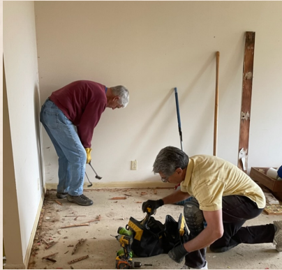
Volunteers working on our new housing venture

Providing Housing and Support for our Community